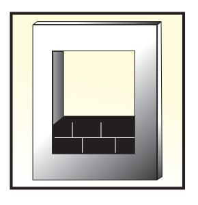
2. Begin stacking bricks, in a bricklike pattern, compress into opening