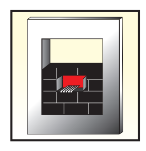
5. Fill opening surrounding penetrant