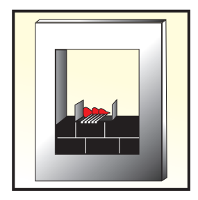
4. Apply FM011 Putty around penetrations as required by Listed system