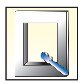
1. Clean the opening